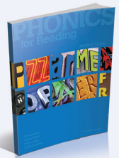
PHONICS for Reading Level Two